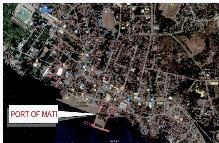
01.2 VICINITY MAP SCALE 1:NTS METERS