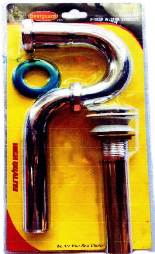
P Trap with strainer Stainless Steel 1 inch