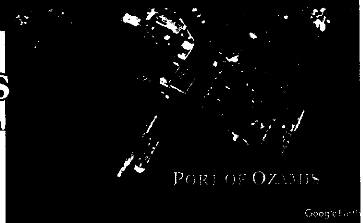
PORT OF OZAMIS